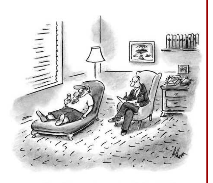
"You can't worry what non-beer drinkers think."